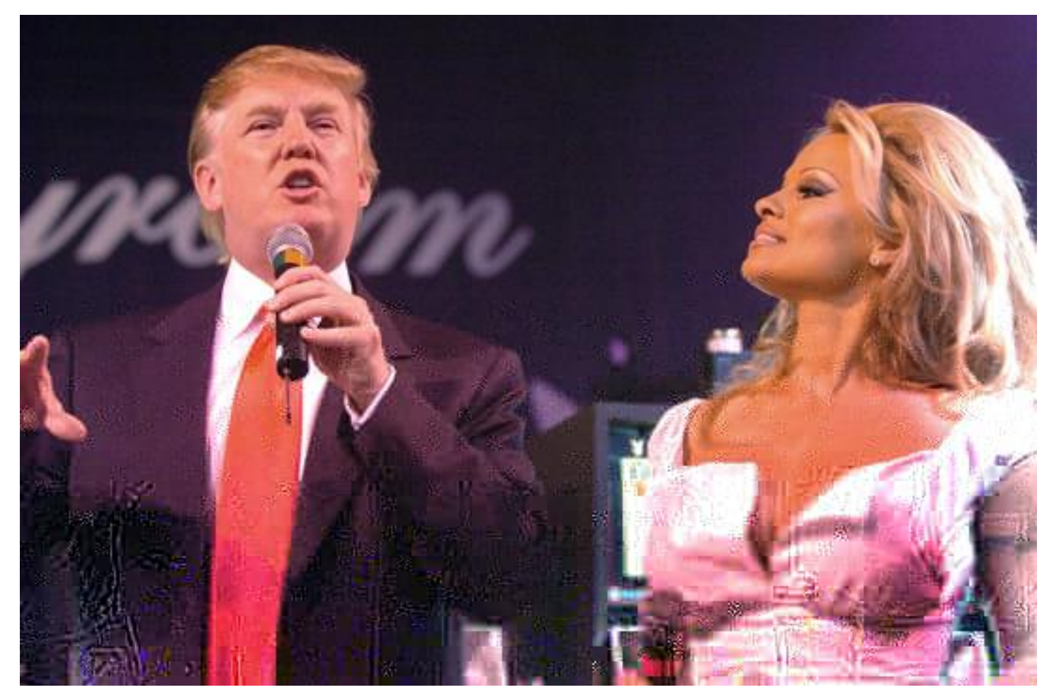
Hfi a d'UbX'5bXYfgcb'UddYUf']bg]XY'h\Y;